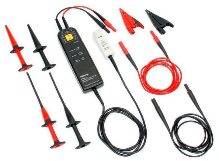
The P52xxA Series probes provide high-voltage differential measurement solutions for any oscilloscope.

Probes and accessories are not covered by the oscilloscope warranty and Service Offerings. Refer to the datasheet of each probe and accessory model for its unique warranty and calibration terms.